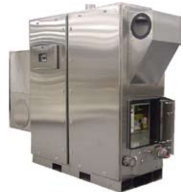
Offshore Hazardous Area